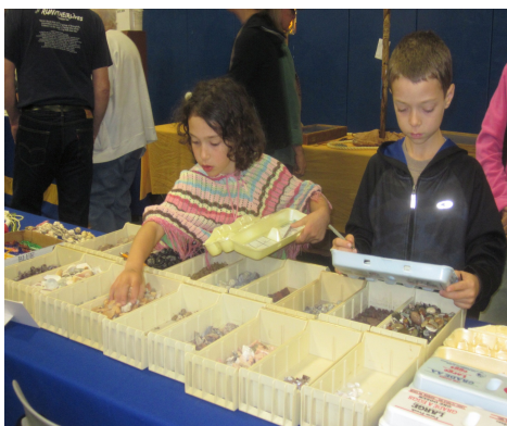
Making egg carton rock collections