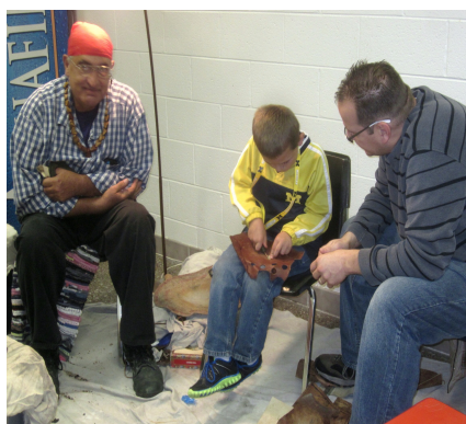
Learning to flint knap

~~~~~ The Livingston Gem and Mineral Society is a nonprofit organization and member of the Midwest Federation of Mineralogical Societies and the American Federation of Mineralogical Societies. Our purpose is to promote, through educational means, public interest and increased knowledge in the fields of mineralogy, archaeology, paleontology, and the lapidary arts. This society was established in 1970. Annual dues are $15 per person or family. Annual shop fees are $10.00 per person. There is an additional fee of $1.00 per day for workshop use. Annual dues and annual shop fees are due on January 1 of each year. The Livingston Gem and Mineral Society publishes The Living Stones. Non copyrighted articles may be reprinted provided that they are properly attributed. Newsletter deadline is the 20th of each month. Articles or correspondence can be sent to LGMS, Hartland Consolidated Schools, 9525 E. Highland Rd. Howell, Michigan 48843-9098.